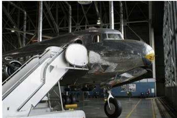
President Roosevelt's trip to Yalta in February of 1945 with leaders of Great Britain and the U.S.S.R.

After flying many transport duties, this plane was retired in October 1961. In 1983 the Sacred Cow was shipped by truck to the Air Force museum for 10 years and 34,000 hours of restoration. It now appears as it did for