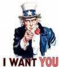
Nominations being accepted now for APW Officers and Board of Directors

Over the past year there has been a lot of talk about the future of AirPower West. In all of those discussions it has always been unanimous that the members want to see APW continue to be active and grow. To keep APW active and interesting I believe it is very important to get new and existing members involved all the time and have a variety of activities and projects going on. Membership is currently free so you can get new people involved at any time by inviting them to any events. Also have new people go to our website at ( www.AirPowerWest.org ) and fill out a membership form to get them on the mailing list for future events.