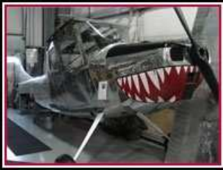
APW Outing to the Spirit of Flight Center August 7, 2010

In our member's survey last year there was a request for more social events like the pot lucks we have been having, but also members wanted to see occasional outings or events organized by AirPower West. With that in mind, I have organized an adventure to a great little aviation museum right here in our area. Mark your calendars for August 7 th , and plan to join me and your fellow AirPower West members at the Spirit of Flight Center in Erie, CO.