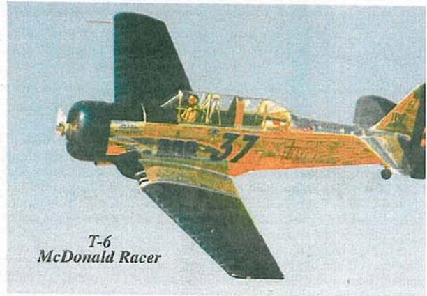
T-6 McDonald Racer

Some classes established a new record winning speed in 2008. To